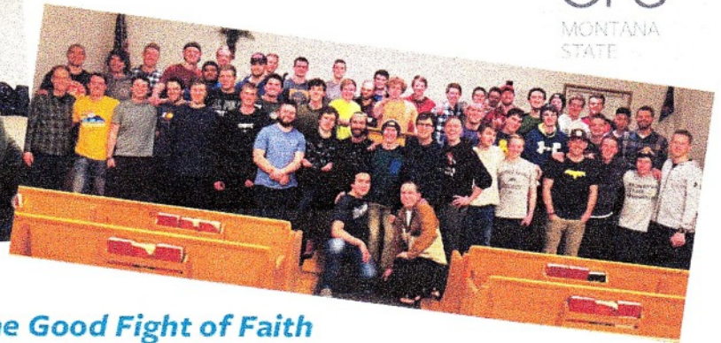
Above: Our Women's and Men's Retreats!