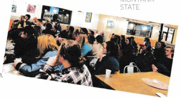
Right: the 50 students at our "Go Night" hearing vision about Summer Mission.