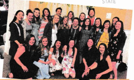
Right: The student leaders that we have the privilege of working with!