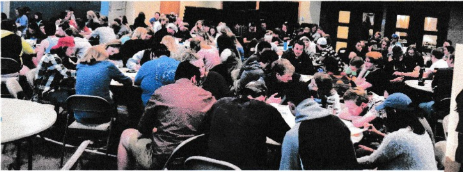
Above: Our last Cru Weekly Meeting of the year!