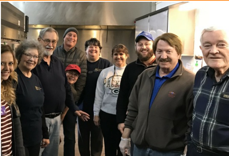
Open Door volunteers January 30