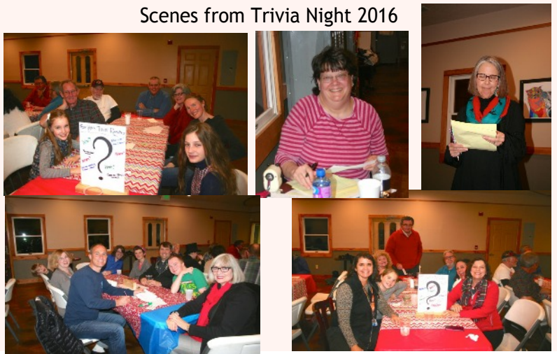
Scenes from Trivia Night 2016