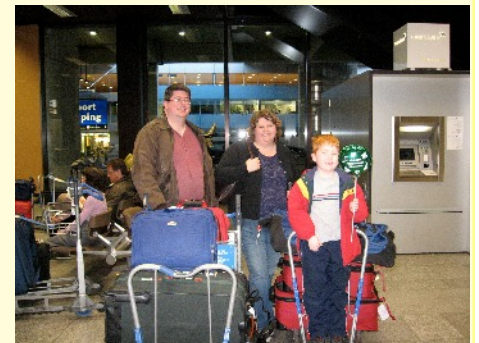
Arriving in Zurich

We want to thank all of you so much for your prayers and financial support over these 10 years and in the years to come as we continue to serve Him in this capacity. Thank you.