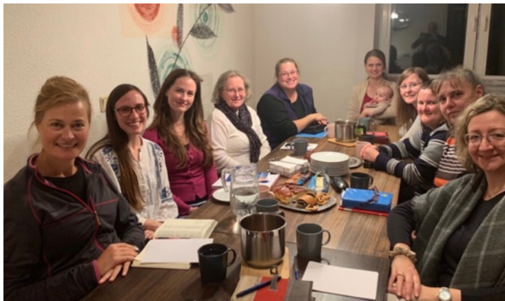
Meeting with women from several CBS Groups running in Northwestern Slovakia.