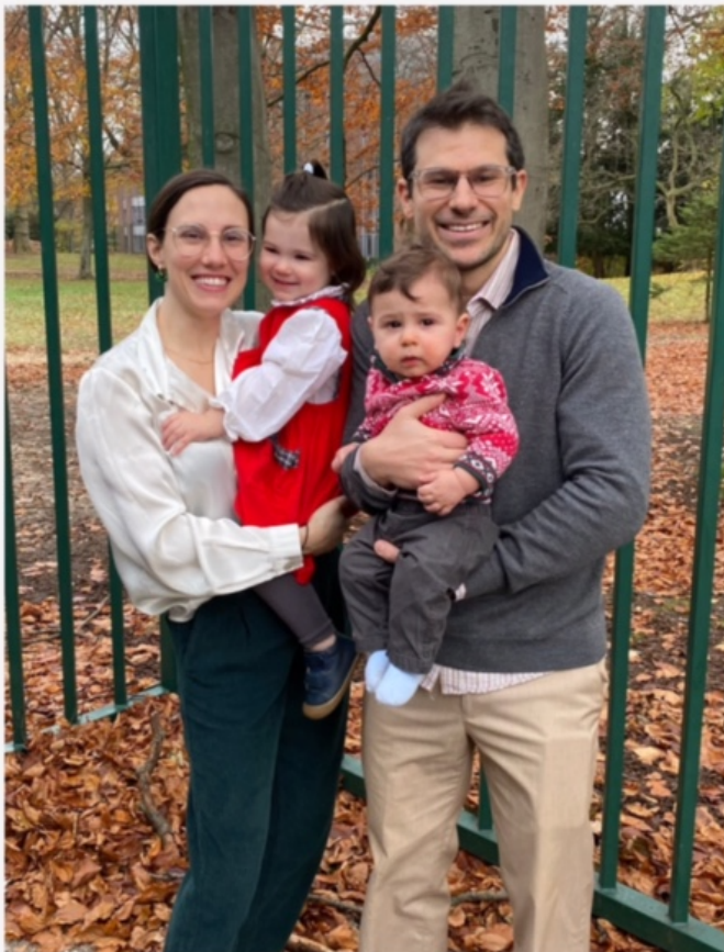
THEY WON'T STOP GROWING!